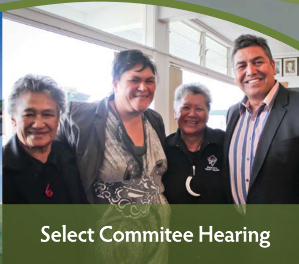
Select Committee Hearing