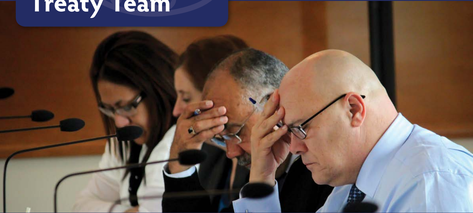
Māori Affairs Select Committee Panel hear submissions made by Raukawa and other groups at the Tokoroa hearing.