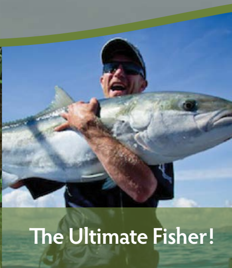
The Ultimate Fisher!