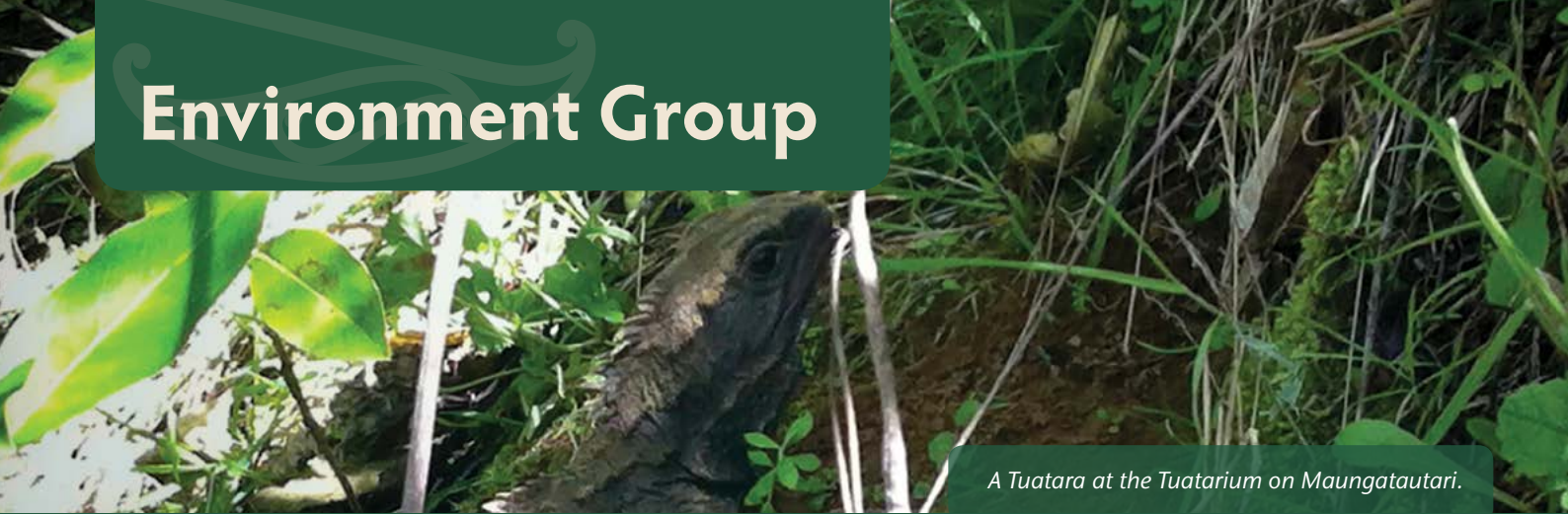
A Tuatara at the Tuatarium on Maungatautari.