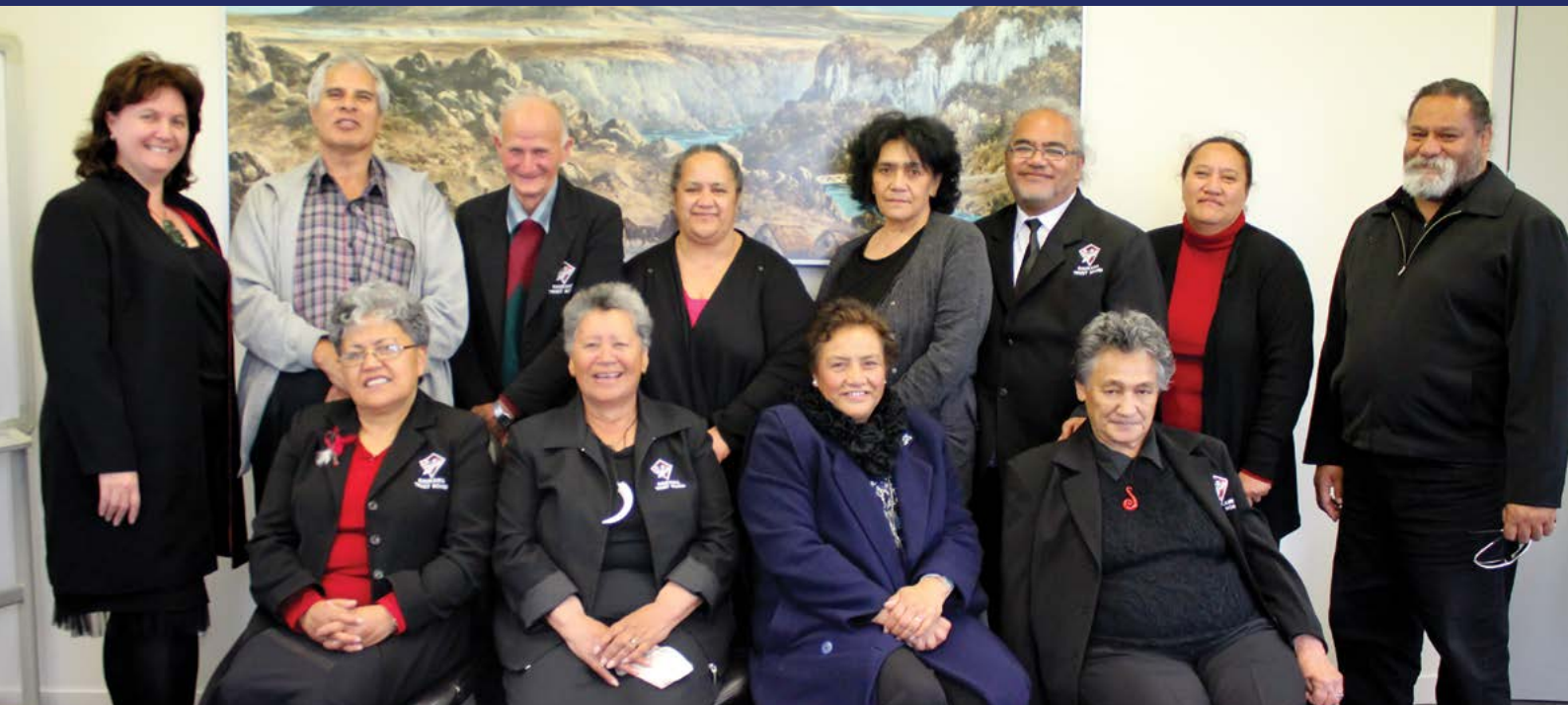
Raukawa staff and kaumātua pose for a group photo after the Select Committee hearing.