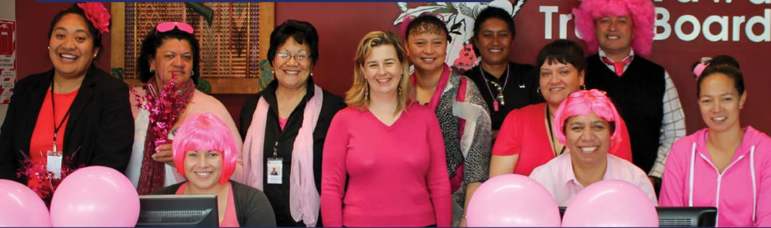
Raukawa staff members go Pink for the Day by proudly supporting Breast Cancer Awareness month at the workplace.

Breast Cancer Awareness. Pink For a Day provides a great opportunity for workplaces across New Zealand to go pink any day in October as part of Breast Cancer Month.