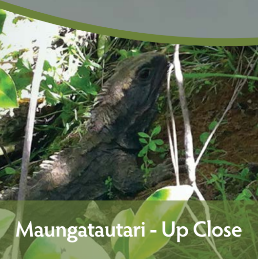
Maungatautari - Up Close