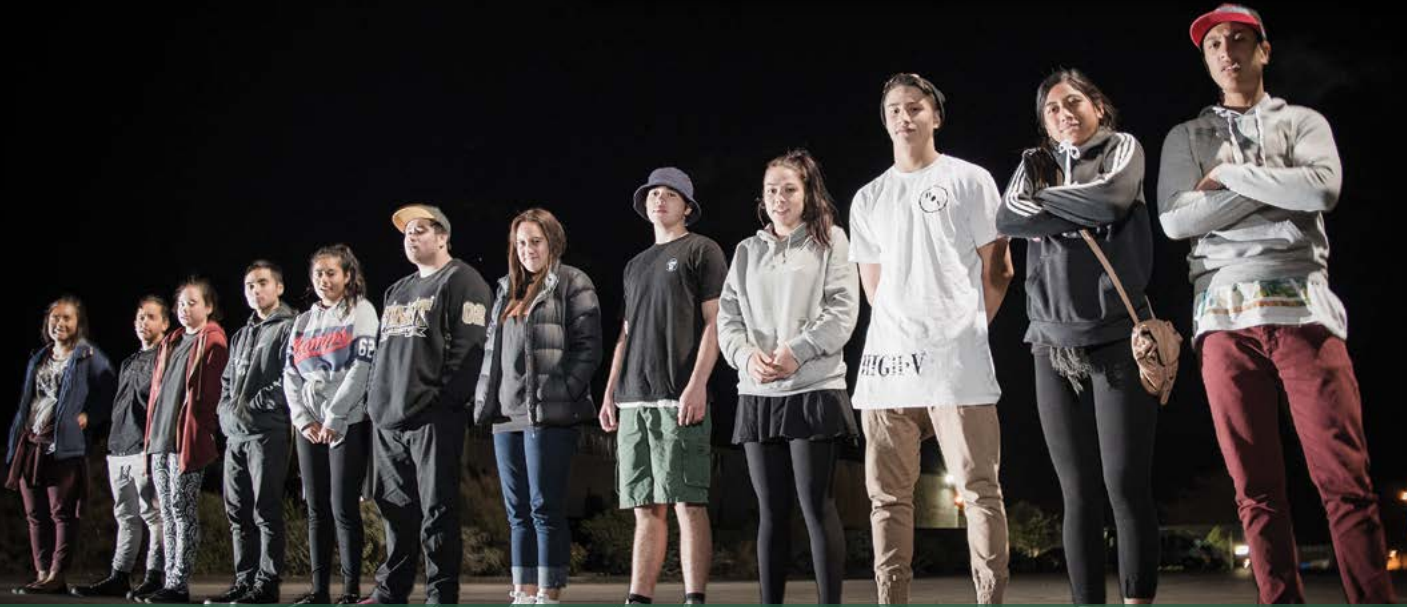
CLUBsters pose for a photo during their weekly CLUBs night in Tokoroa.