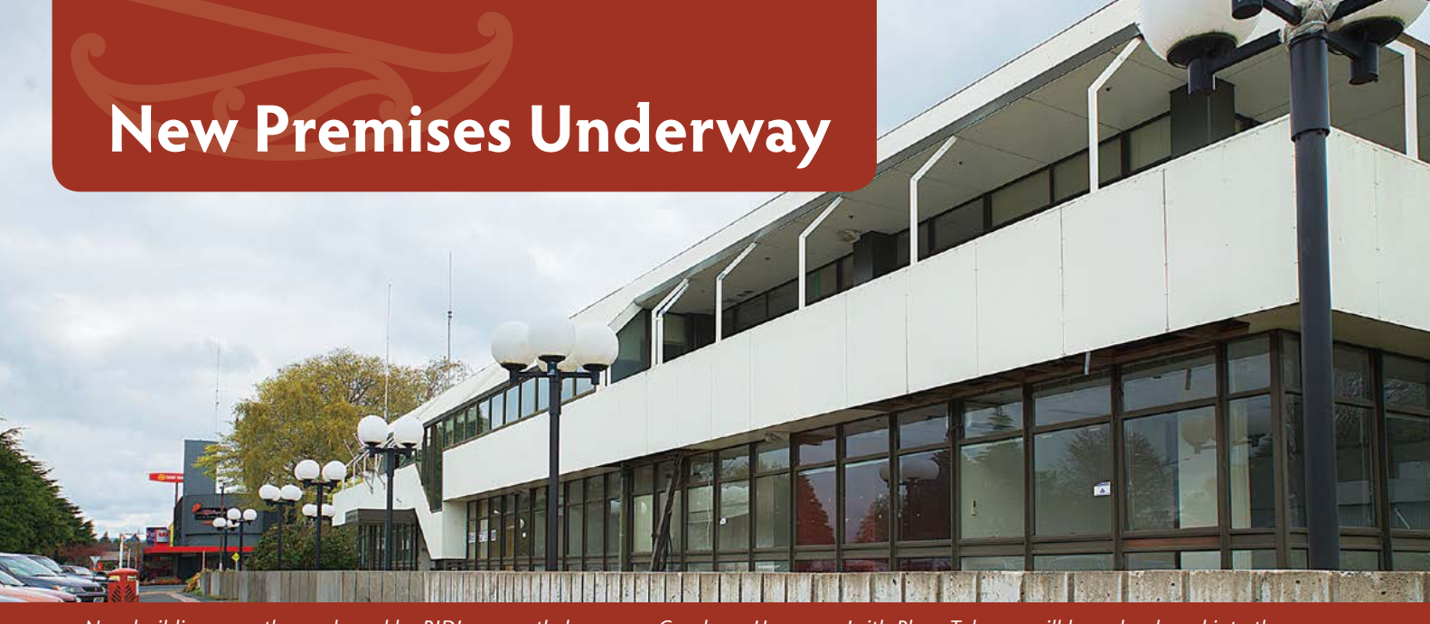
New building recently purchased by RIDL, currently known as Grayburn House on Leith Place Tokoroa will be redeveloped into the new headquarters for Raukawa.

Redevelopment has begun on a building that will soon become the new headquarters for the RST and RCT. The new building currently known as Grayburn House is on Leith Place in Tokoroa.