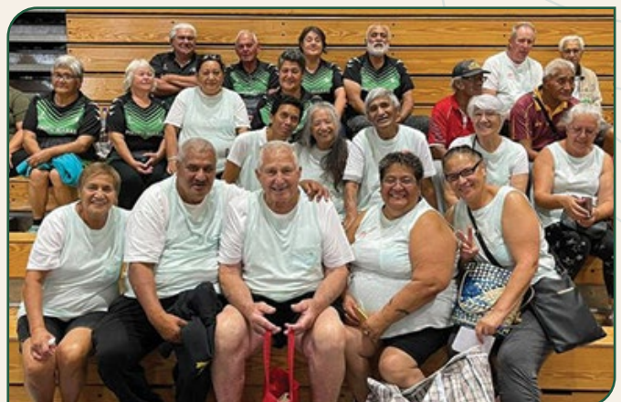
Our kaumātua athletes just before the march-past commences.

Held at the Te Awamutu Events Centre ASB Stadium, thirteen teams, with the vast majority of participants being well past the minimum age of 55, were put through their paces during a series of six indoor events testing skill, guile, agility, and accuracy. The event was a major success, providing an opportunity to reconnect with one another through laughter, comradery and fun activities.