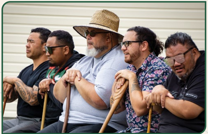
Kaikōrero on the paepae at Aotearoa Marae during the 3-day wānanga.

Over 100 people attended the programme this year, which was held at Aotearoa Marae. The wānanga focuses on te reo Māori, whaikōrero, karanga, history of the area, karakia, waiata and marae tikanga with a unique half day bus trip to Kāwhia, visiting sites of cultural significance.