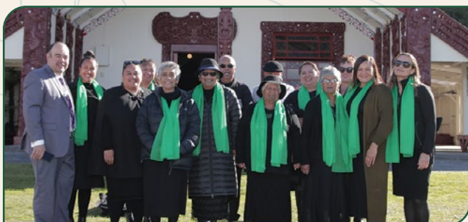
Raukawa rōpū attends the kawenata signing at Waihi Marae near Tokaanu.

In collaboration with Waikato-Tainui and Ngāti Tūwharetoa, we committed to a new kaupapa with the Crown and the Ministry of Education; He Puna Wai Nui, He Ia Rere Roa. The kawenata with the Ministry of Education aims to realise iwi aspirations for Māori learners along the Waikato awa. The agreement establishes a framework for how the ministry will work in partnership with the iwi to develop initiatives, priorities and solutions. The kaupapa talks of the everlasting transition of knowledge from one generation to the next; Mai te kōpū, ki te kōpū.