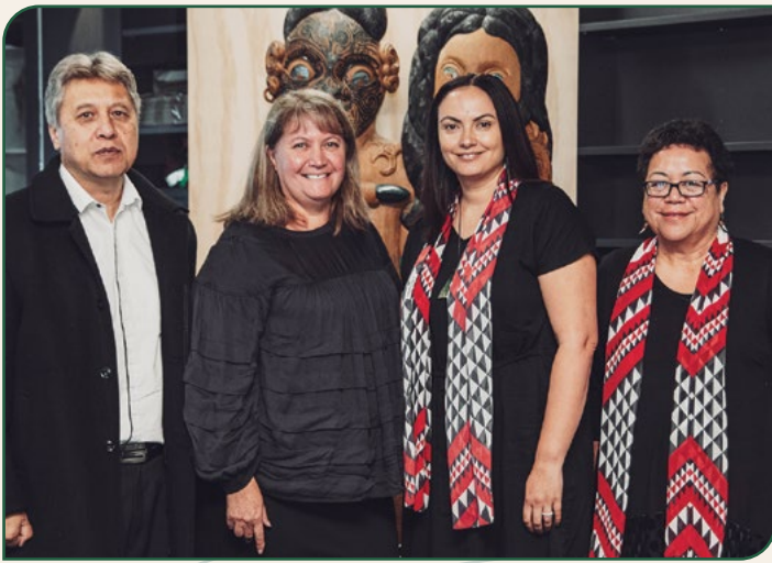
Leaders from both iwi sign the kawenata at Te Whare o Raukawa, Tokoroa.