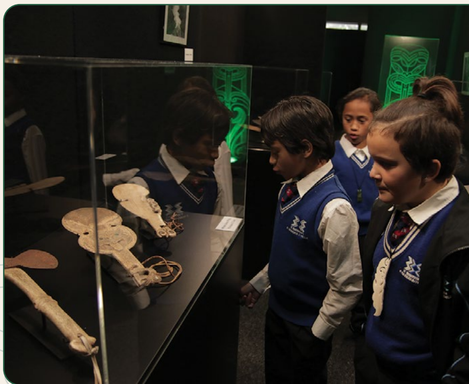
Students from Te Whare Kura o Te Kaokaoroa o Pātetere enjoy the exhibition.

The multi-media exhibition celebrated Raukawa history, taonga and stories. Over 600 people attended the weeklong display. Attendees included stakeholders from local government, kura, along with our own kaimahi and kaumātua. Along with the exhibition, we launched the website to our education strategy - www.manawapouhīhiri.org.nz