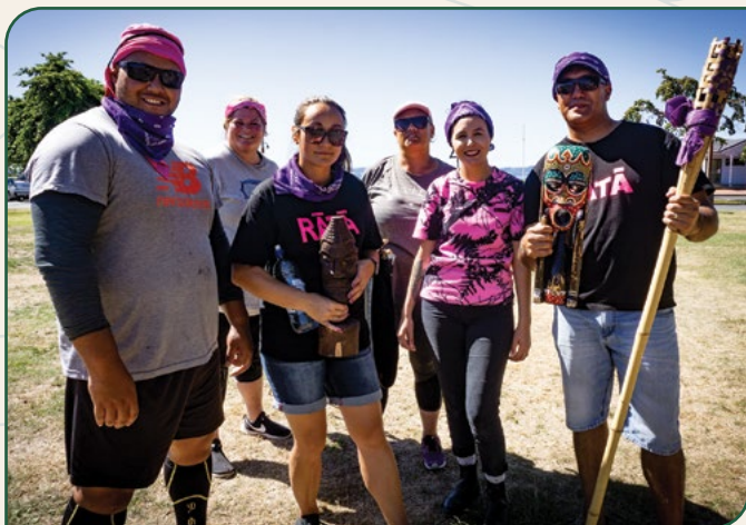
Raukawa kaimahi take on the Survivor Challenge in Rotorua.