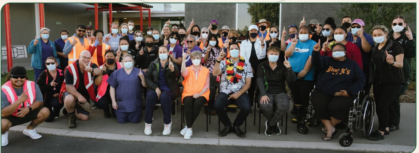
Community partners, kaimahi and volunteers celebrate after a long Super Saturday that resulted in over 500 people being vaccinated.

Super Saturday, a nationwide vaccination drive, was held at the events centre in Tokoroa on 16 October. Provided by community partners, the event was ranked 4th in the Waikato with 571 vaccines administered and over 47% being Māori and Pasifika. Spot prizes and give aways were provided by local businesses to help push the drive.