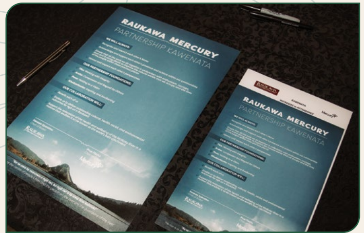
Kawenata documents signed at Te Whare o Raukawa, Tokoroa.

It has been 20 years since the Raukawa Trust Board and Mighty River Power signed its Memorandum of Understanding committing to support and work together to achieve agreed outcomes. Over this time, we have both honoured our commitments and continue to build a strong relationship that respects each other's values. To mark this longstanding relationship we signed a kawenata at Te Whare o Raukawa that outlines our partnership and how we collaborate to bring benefit.