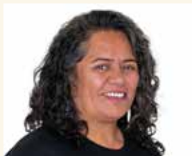
Erina Maui Mōkai (Pakaketaiari) Marae