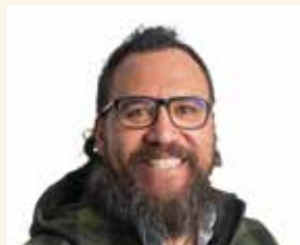
James Whetu Ruapeka Marae