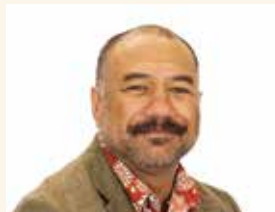
Louis Armstrong Ngātira Marae