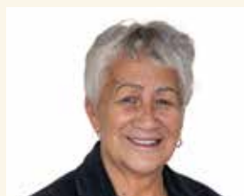
Whakawhiti Gage Tangata Marae